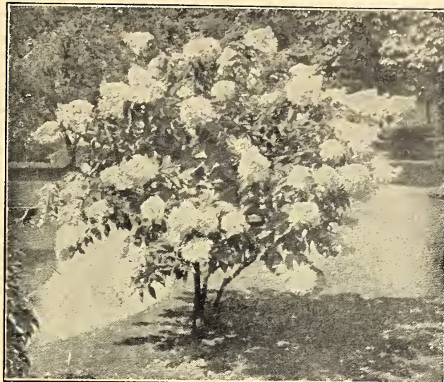
Hydrangea P. G.